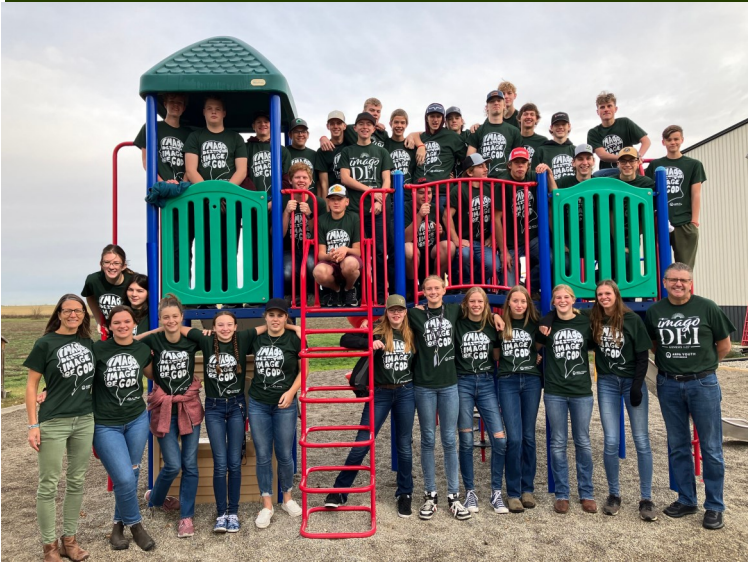
ARPA Youth Conference